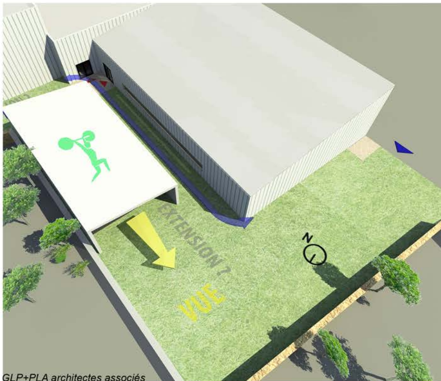
GLP+PLA architectes associés