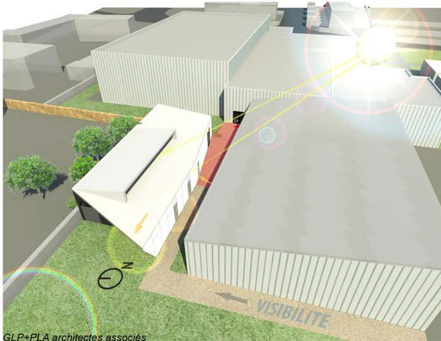
GLP+PLA architectes associés