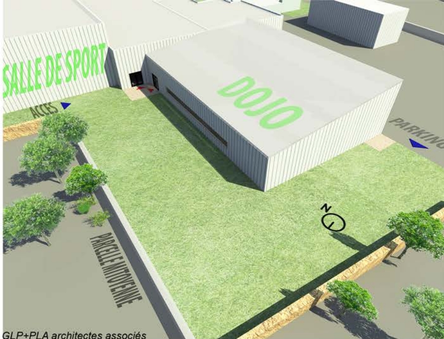
GLP+PLA architectes associés